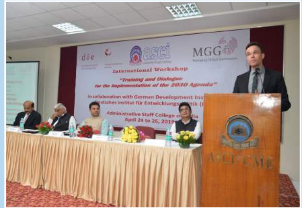
April 24, 2019: International workshop on "Training and Dialogue for the Implementation of the 2030 Agenda" at College Park Campus