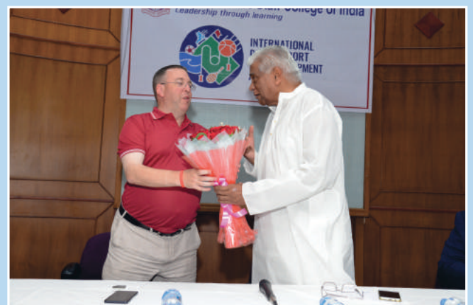
April 5, 2019: The British Deputy High Commissioner HE Andrew Fleming at a programme organized in Bella Vista to mark the International Day of Sport for Development and Peace