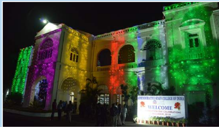
December 6, 2019: Bella Vista, the then Nizam Son Prince of Berar's residence and currently the headquarters of ASCI, decked up for Foundation Day Celebrations