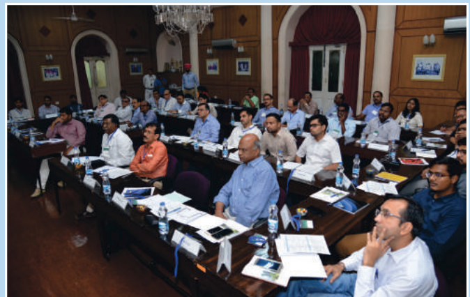
July 8, 2019: Officials of Asian Development Bank during a programme in Bella Vista