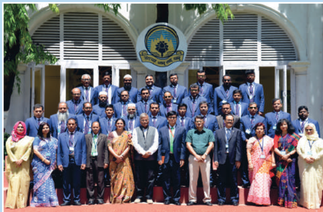
June 19, 2019: Bangladesh civil services officials after completing a course in Bella Vista